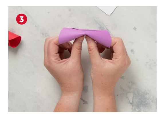
Grab one of your own fortunes and slide it into the cookie, then turn the cookie so that the seam is on one side. Take the open edges, and bend them together. The center will crease and the cookie shape will form.