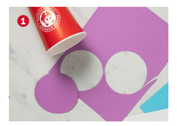
Place your round object down on your paper and trace a circle, then cut it out.

Fortune cookies are a staple in American Chinese restaurants, especially Panda Express. Unlike other cookies, they have a fortune inside! When you've run out of yummy fortune cookies from Panda, why not make your own (though not as yummy) to share with family and friends? You can even stuff them with your own fortunes (see Fortune Writing Activity)!