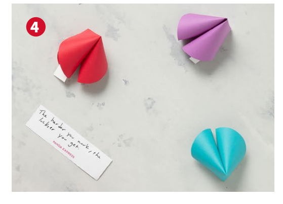
Add a dot of glue about an inch out from the center crease, and press the two halves together. It's finished and ready to share! Can you see the fortune inside? Just slide it right out to read – no need to break the cookie.